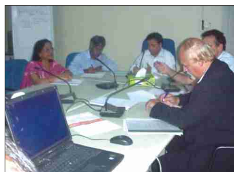
Meeting between twinning mission and WARPO professionals

Until now cooperation between Bangladesh and Netherlands, within the framework of Twinning Arrangement, was very successful. So second extension is underway as agreed in wrap up meeting, which was held on 13, June 2007, in MoWR.