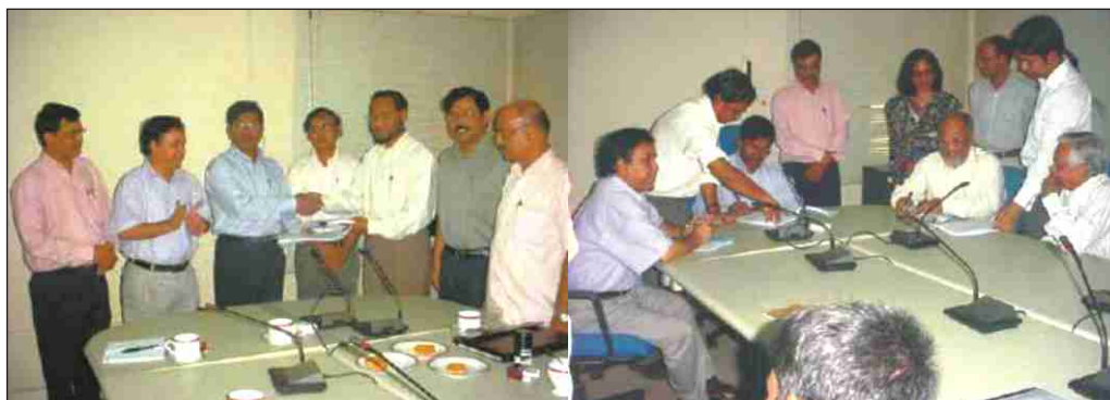
Contract Signing Ceremony of Impact Assessment of Indian River Linking Project for Inter Basin Water Transfer between WARPO, IWM and CEGIS in association with DDC on 29th April 2007 at WARPO

A contract signing ceremony was held at WARPO conference Room on 29 April 2007 for the study Impact Assessment of the Proposed Indian River Linking Project for Inter Basin Water Transfer . The study comprises of two components, namely Water Resources Support/Mathematical Modelling and Environmental Support. Institute of Water Modelling (IWM) and Center for Environmental and Geographic Information Services (CEGIS) in association with Development Design Consultant (DDC) Ltd have been contracted as consulting firm to carry out the study of Water Resources Support and Environmental Support component respectively. DG WARPO, Executive Director of CEGIS and IWM and other officials of the concerned organizations were present in the ceremony.