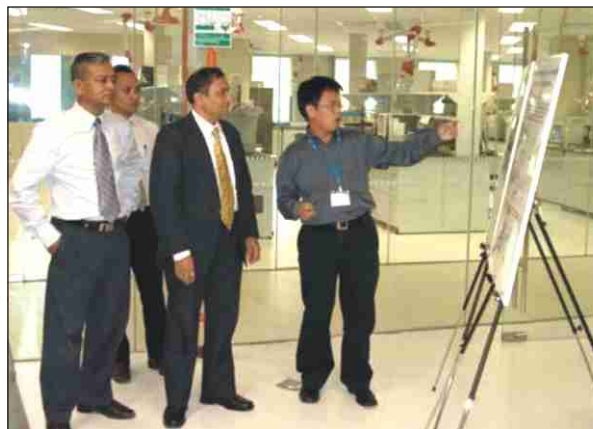
DG, WARPO visits the state of the art laboratory in Singapore

Director General, WARPO attended the Experts Consultation Meeting on the Draft Asian Water and Development Outlook (AWDO) held in Singapore on 23 August 2007.